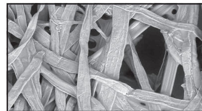
Economy Cellulose Cross Section 300X